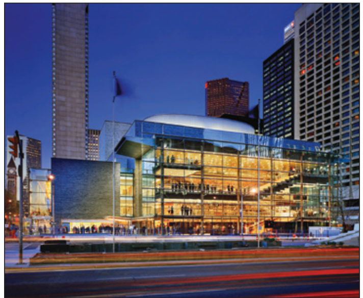
2006 Ontario Concrete Award winning project for Structural Design Innovation

Interior noise from mechanical systems was subdued through the use of a large plenum between the basement and orchestra level floors. The concrete slabs provided a clean, flat soffit for efficiently and silently directing air to special sleeves for circulation to seating areas throughout the hall. Overall, the building's acoustic design achieved its goal of an N-1 sound isolation rating.