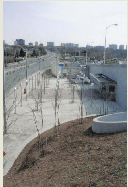
Sheppard Subway - Leslie Station