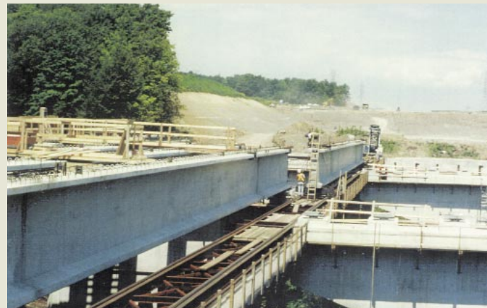
Highway 407 - Bronte Creek Bridge