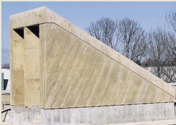
Sheppard Subway - Bayview Station