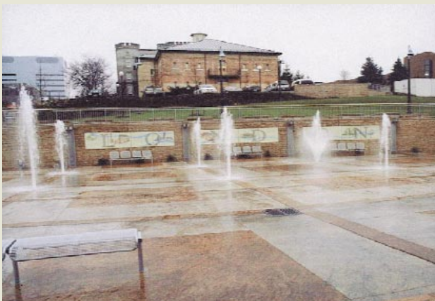
Forks of the Thames Revitalization