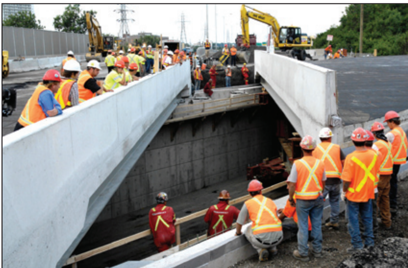
2008 Ontario Concrete Award winning project for Specialty Concrete Applications

The decision by the MTO to incorporate rapid bridge replacement technology in the Island Park contract had significant positive impact on many levels. The project was completed in a single construction season vs. the conventional approach that would have taken two seasons. The overall project cost savings to the owner was conservatively estimated at greater than two million dollars. Equally important, the safety of the workers and travelling public was improved while the project impact on the environment and community were greatly reduced. The Island Park project has shown that given the right environment, rapid lift technology can be implemented to complete the project and realize overall project cost savings.